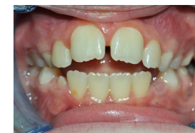
8 years old baseline condition