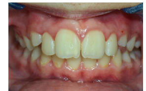
6 months after